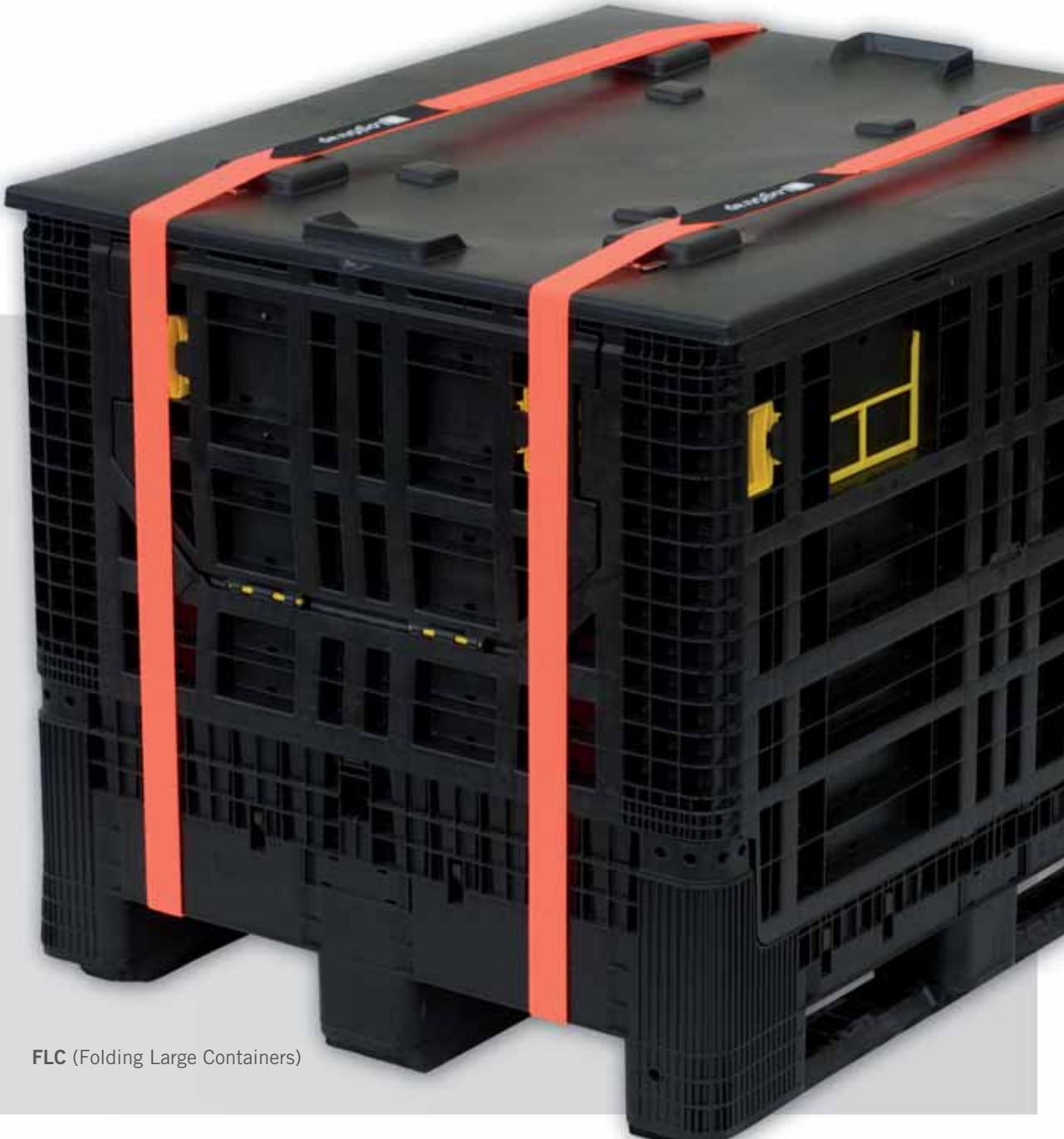
FLC (Folding Large Containers)